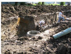
Picture of previous sanitary sewer project in Moulton.

Communities can submit for CDBG Water/Sewer grant applications annually in November.