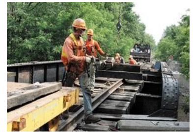
Chariton Valley Planning & Development Council assisted this project with the administration of funds, as well as state & federal regulations in this process.