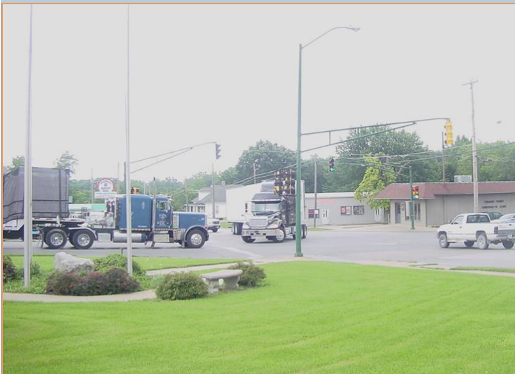
Above: The intersection of Iowa Highways 2 and 5 carries a five-year accident history of 106 crashes. With an accident rate of 1.28, much higher than the state average of .81, CVTPA counties are encouraging the Iowa Department of Transportation to assign the roadway priority in redesign and reconstruction. The Iowa Department of Transportation is presently preparing its Five-Year Program of roadway funding priorities and will present the program by year's end.